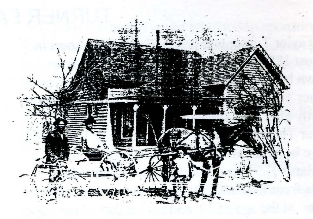
The Turner Family, circa 1900