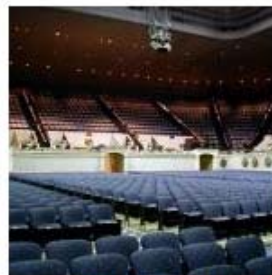
Constitution Hall Auditorium