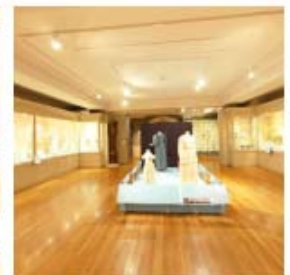
DAR Museum Gallery