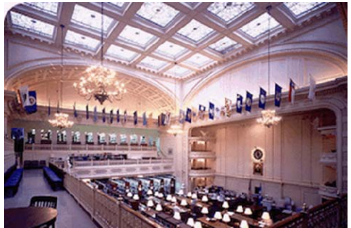
DAR Library, Washington, D.C.

From novices to professionals, the DAR Library offers a wealth of unique materials for researchers of all levels. Since its founding in 1896, the DAR Library has grown into a specialized collection of American genealogical and historical manuscripts and publications, as well as powerful on-site databases. The DAR Library collection contains more than 225,000 books, 10,000 research files, thousands of manuscript items, and special collections of African American, Native American, and women's history, genealogy, and culture. Nearly 40,000 family histories and genealogies comprise a major portion of the book collection, many of which are unique or available in only a few libraries in the country.