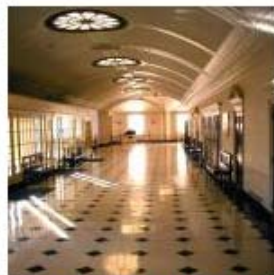
Constitution Hall Lobby