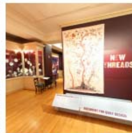
DAR Museum Gallery