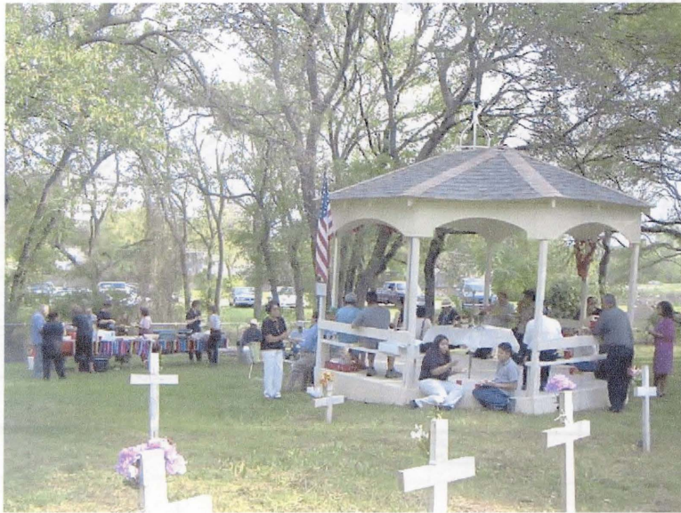
Dia de los Muertos, November 1, 2003