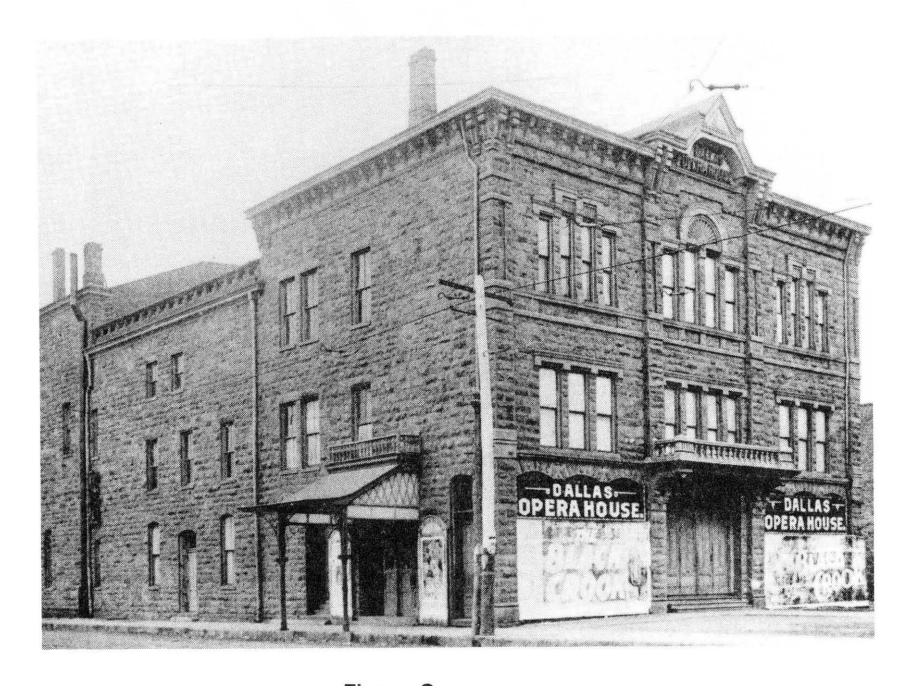
Figure 2 - ca. 1895