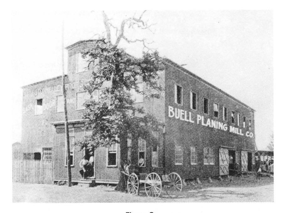
Figure 3 - ca. 1900

John: No, down around the suburbs, but there wasn't suburbs. Dallas wasn't big enough to have suburbs. But, anyhow, they run one of them cars up there on Live Oak. Right just before they got to the tracks, they stopped it right at the tracks. The fire hemmed it in and burnt the car up. I was there...I seen that.