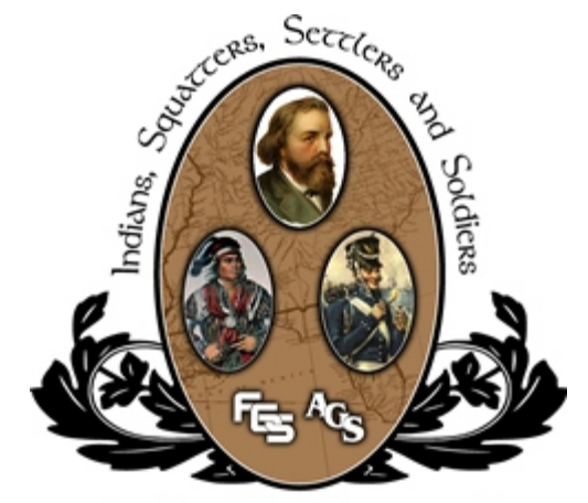
In 'Che "Old Southwest"