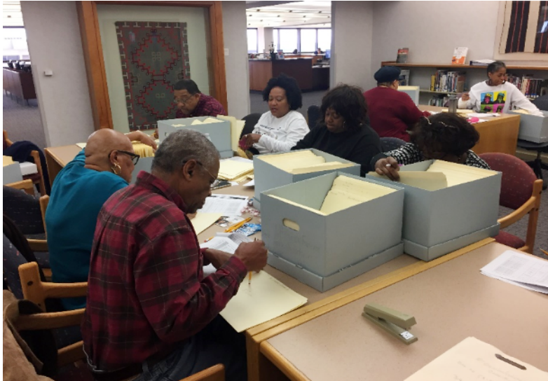
Volunteers hard at work