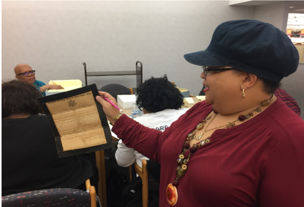
WWI discharge certificate bound in leather